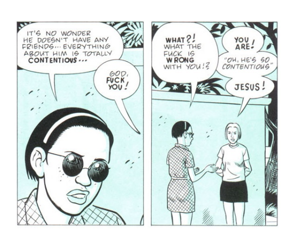
Figure 10: "Fuck You!" Clowes 57