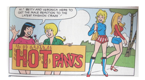
Figure 5 "Hot Pants." Laugh Mag. No. 248 1971

After over sixty years of periodically publishing new material we can se many differences in Betty and Veronica; but we still see much of the same. Both girls (as other characters from the series) have changed in their own particular way through the decades, given certain social, political and cultural context. After feminism arose massively, Betty was attributed with new and different abilities such as mechanics and political discourse. Veronica gained entrepreneur skills, following the steps of her rich and successful father. They have also evolved with day-to-day novelties: they now have iPods, mobile phones, laptops and skinny jeans. And they also get informed of each particular fad as it comes (during the 70s they acquired hot pants and danced in disco contests; while in the 90s they fell for boy bands and digital pets).