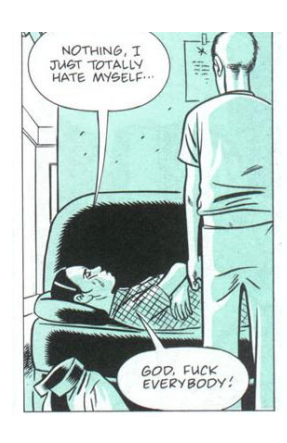
Figure 8. "Fuck Everybody" Clowes 61

These alternative fads (which are actually counter-culture fads (Bennet et al. 5) turned into fads) multiplied during the 1980s and 1990s. A sense of indifference towards massive pop culture and the reaffirmation of personal styles and opinions arose. With this, societal values start to be ignored, while personal problems become the primary focus. As Ghost World and all its predecessors attest, whatever society's norm is instated at the time, it is not taken into account. In the late twentieth century adolescence is not about social values anymore: it is about personal troubles; about the sentiment of loss and angst, and how each individual must overcome their own obstacles to find their own self.