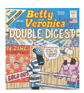
Figure 6 N "Zinc Cover." B&V Double Digest No. 103 2002

Nonetheless, the core themes of these young girls, which define their identity, remain the same. B&V still revolve around the "correct" values they were born and raised with; their storylines tend to avoid personal, individualistic and controversial subjects, such as religion, sex, depression or alcohol; they always end up doing "the right thing". After six decades, their original spirit and optimistic nucleus remain. B&V are still here, day after day, week after week, year after year, to keep entertaining, to represent the all-American teenager and family, and to be the best sweethearts that the United States can have.