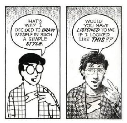
Figure 4. "Simplicity." McCloud 36

After over sixty years of periodically publishing new material we can se many differences in Betty and Veronica; but we still see much of the same. Both girls (as other characters from the series) have changed in their own particular way through the decades, given certain social, political and cultural context. After feminism arose massively, Betty was attributed with new and different abilities such as mechanics and political discourse. Veronica gained entrepreneur skills, following the steps of her rich and successful father. They have also evolved with day-to-day novelties: they now have iPods, mobile phones, laptops and skinny jeans. And they also get informed of each particular fad as it comes (during the 70s they acquired hot pants and danced in disco contests; while in the 90s they fell for boy bands and digital pets).