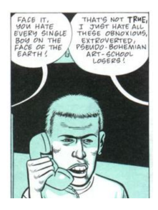
Figure 7. "Hate" Clowes 26

E&R were born in an era of change, a time when values were being questioned. A decade where "fuck" was already being used in massive media; sexually transmitted diseases had become a current event, and drug use was spreading in high schools. In the midst of all of this turmoil adolescents were meant to find their own way out. Enid and Rebecca portray the difficult scavenge of one's own identity, the sentiment of an unidentifiable world and the development of individual views and styles in contemporary American adolescence.