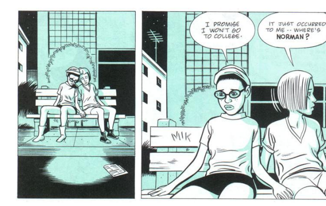
Figure 10: "Difference." Clowes 74