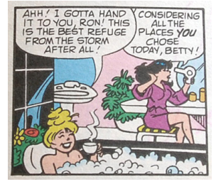
Figure 1. "Getting Ready." B&V Double Digest No. 66 1997.

Even though Betty is the classic blonde girl-next-door, and Veronica the snobbish rich girl in town, appearing to be complete opposites, these young women develop what seems to be an average, innocent, girl-to-girl friendship; a "proper" image for girls all around the country. They stay inside the mold of the young all-American teenage girl. Together, they participate in school activities, go to the beach, to the mall; they help each other get ready for prom, among many other predictable activities.