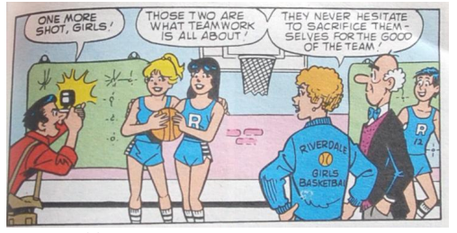
Figure 2. "Teamwork." B&V Double Digest No. 121 2004.

They follow whatever fashion is in and chase popular currents. B&V also belong to what would seem to be a structurally "conventional" family: both parents at home, a stable household in a pretty neighborhood, a sibling or two (in the case of Betty; Veronica's an only child), and an occasional pet.