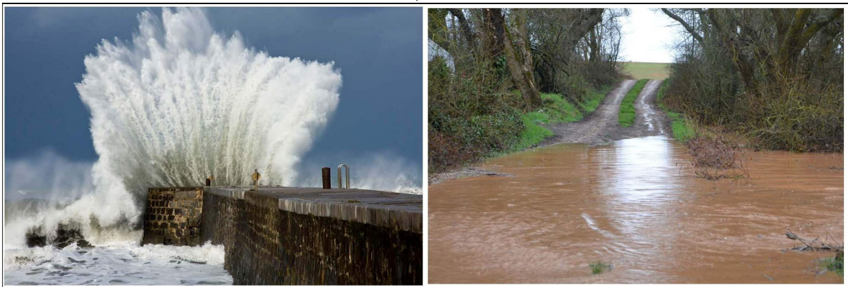
Figure 2. Submission. Storm at the breakwater of Deba (Guipúzcoa), and flooding of the River Castro in Ventosa de Fuentepinilla (Soria).

Agriculture, cattle rearing and trade together with an increase in population led to “adaptation” (Figure 3), a sedentary lifestyle and the birth and growth of towns and Communication Routes. Villages live and coexist within the town’s framework. This second stage is characterized by construction works that minimize environmentally destructive impacts and the effective adaptation to and integration with nature’s processes (Van der Ryn & Cowan,