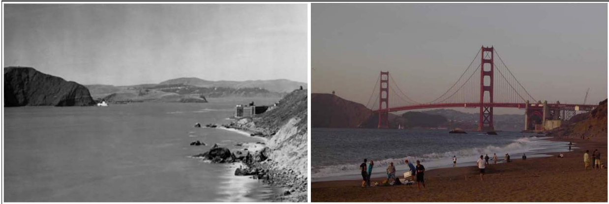
Figure 1. Golden Gate Strait before the construction of the bridge (Site) and afterwards (Place).

In the conversion process from site to place conflicts arise between urban development pressures and conservation planning, and presents challenges for planners and landscape ecologists around the World (Sanderson et al., 2002). The idea of the bridge, “to cross over”; of the harbour, to “shelter”; of the dam, to “store water”; of the road, to “improve mobility”; of the lighthouse, to “guide”; of the castle, “to defend oneself”; of the town, to “live and live with”; of the church and monastery, to “pray or perceive silence”, lead to constructing in order to transcend and acquire meaning (Egypt, Greece or Rome); or to occupy the natural setting, at times irrespectively and negligently. For some years now, we have also had to take into account the tunnel, to “shorten distances” and the airport, to “connect the world”. This study is an investigation into the landscape, the place, the significance or attack on the natural location by the human being.