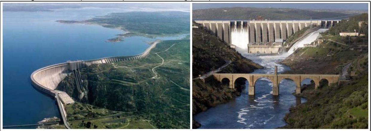
Figure 8. Almendra dam (Salamanca-Zamora) and Alcántara dam and bridge (Cáceres).

As shown in the first picture (Figure 8), the Almendra dam is much more integrated into the landscape, with its curvilinear forms and the tension occurring when containing reservoir water. Zero impact is impossible since it creates a huge lakeshore, isolating areas previously connected, and transforming the environment into a mosaic of fragmented habitats, but it can sometimes be positive because new surface water produces new wildlife habitats and new uses (Lopes et al. , 2014). It is a clear example of how a civil engineering work can improve the landscape in certain aspects and produce a benefit to society, such as electricity production and regulation of river flows.