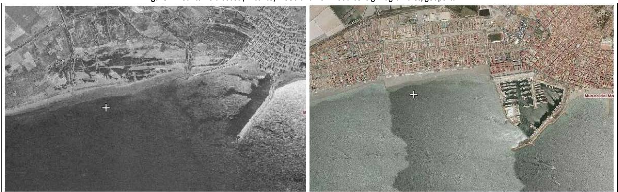
Figure 11. Santa Pola coast (Alicante): 1956 and 2012.

The evolution of uses and customs has changed the distribution of water sheltered in harbours. Traditional fishing has given way to boating for sport, providing the town with a “living” for leisure based on the magnificent climate, the many hours of sunlight a year, scarce precipitations and a calm sea suited to recreational boating and for children and grown-ups to be bathed by waves. However, abusive growth, i.e., urban development occupying active beach areas, has created an artificial, harmful, rash landscape in a continuous process of change to artificially restore natural sand areas (Negro, 2014), as can be seen in Santa Pola, Alicante (Figure 11). What has happened to the dune field? What has happened with the east lee shore and the crops? The town’s invasion destroys natural landscape with economicist aims, simulated, increasingly larger and less sensitive populations. The town is often not a “place” for coexistence but the clearest example of the insignificant landscape devoid of emotions.